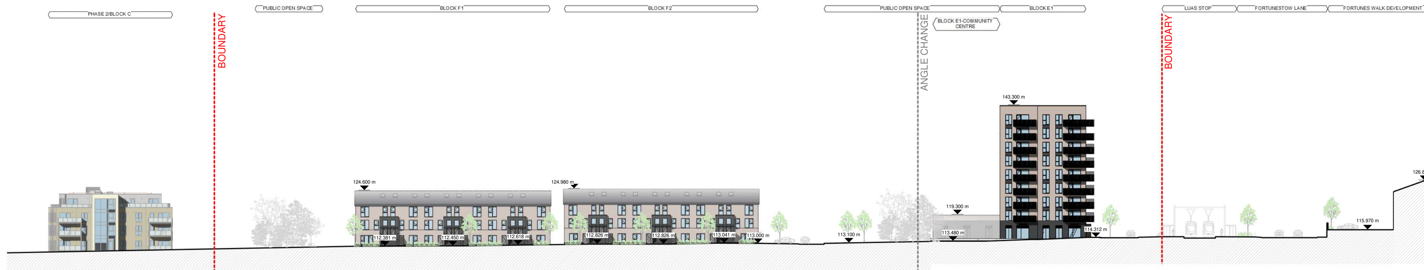
2 CONTIGUOUS SECTION BB 1 : 500